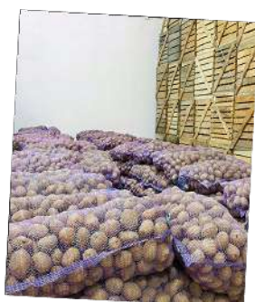
Advance Cold storage